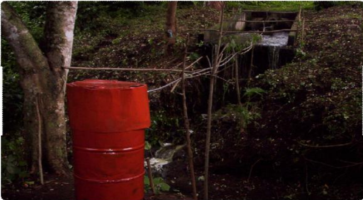
Figure 2: Unit testing at pilot scale, located on the grounds adjacent to the concrete-lined canal and along the stream to which discharge their effluent.