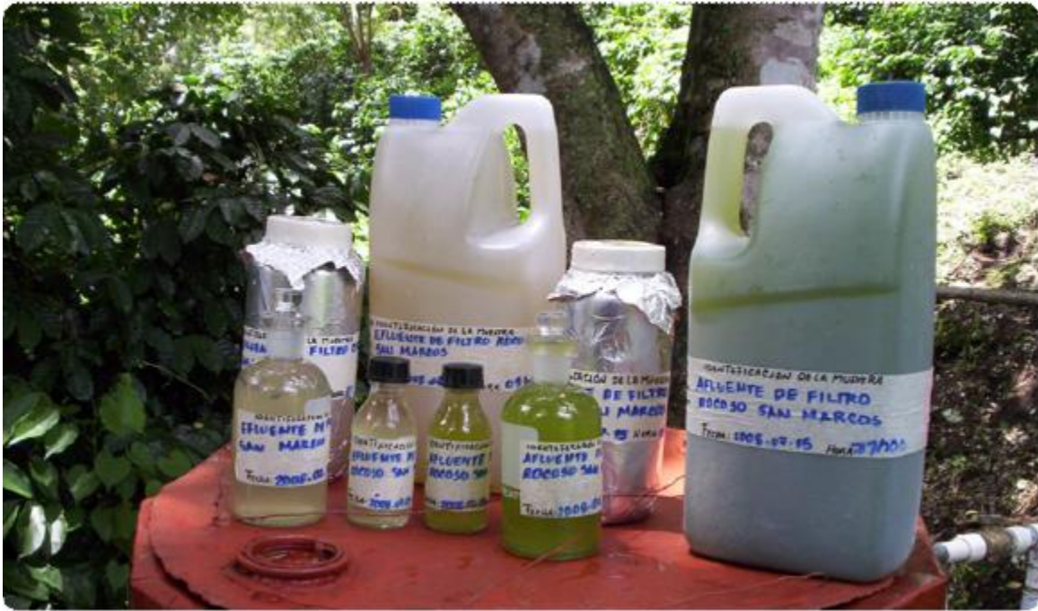
Figure 3: Sample collected in the influent and effluent of the filter rock. You can see the difference in color, green in the influent and effluent clearer.